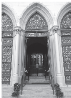
"Our Doors are Open Wide"